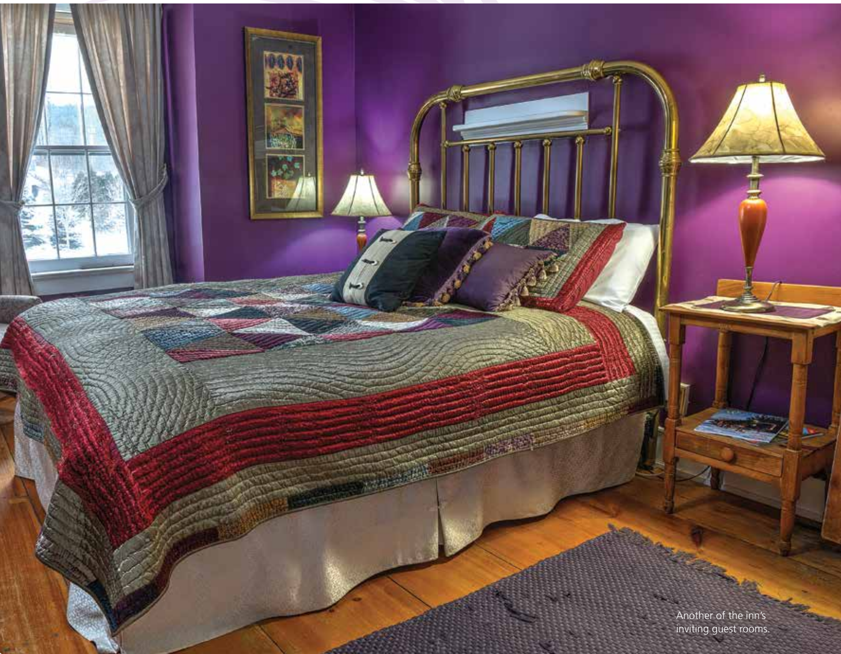
Another of the inn's inviting guest rooms.